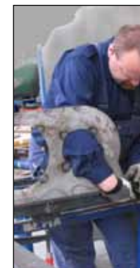
Fixing of casing