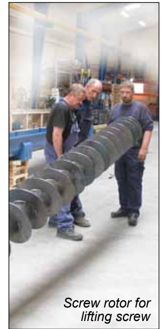
Screw rotor for lifting screw

Distribution system consisting of two screws and receiving buffer. Complete delivery incl. damper, supporting and engineering/construction.