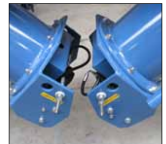
Bottom Bearing Construction