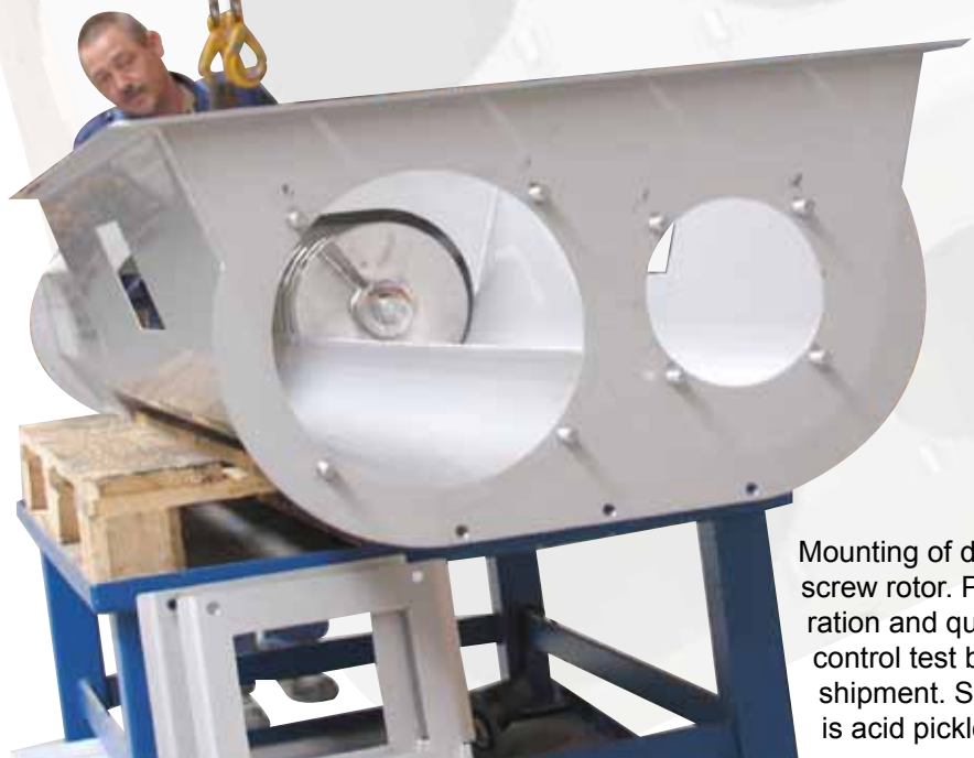
Mounting of double screw rotor. Preparation and quality control test before shipment. Surface is acid pickled.