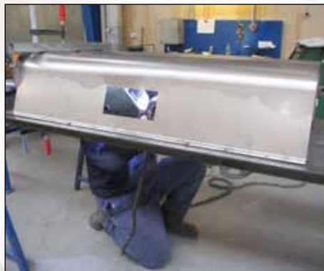
Welding of double screw casing