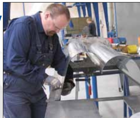
Mounting of casing parts for complete screw casing