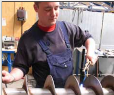
Aligning of stainless screw rotor