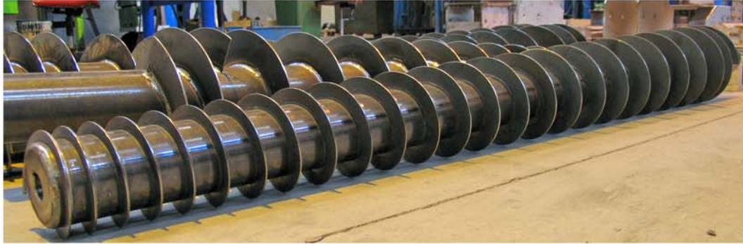
Conical screw rotors, Produced in batches of 25 pcs.